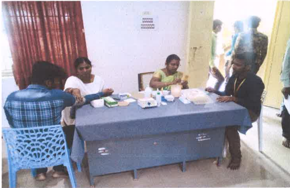
Photo of Free Medical Checkup for Our Students