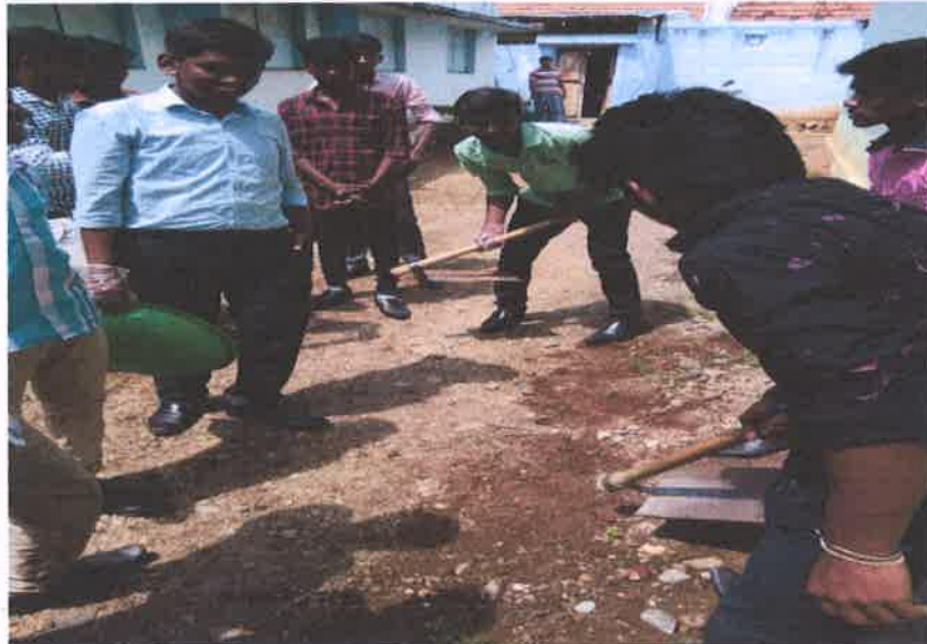
Cleaning Program at Kallipatti Village area