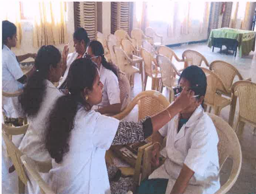
Photo of eye checkup in Seminar Hall

PRINCIPAL JKK MUNIRAJAH COLLEGE OF TECHNOLOGY T.N. PALAYAM (Po)-638 506. GOBI (Tk), ERODE (Dt).