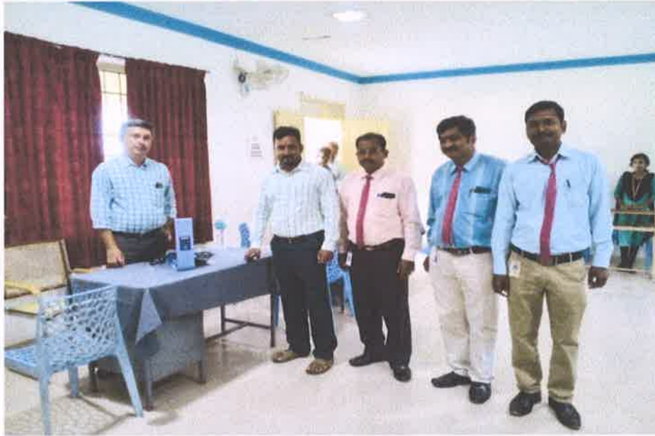
Photo of Principal with Eye camp Doctor

PRINCIPAL JKK MUNIRAJAH COLLEGE OF TECHNOLOGY T.N. PALAYAM (Po)-638 506. GOBI (TK), ERODE (Dt).