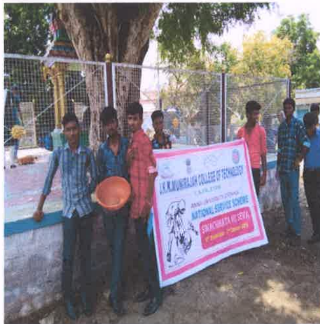
One day Cleaning Program at Kallipatti Temple