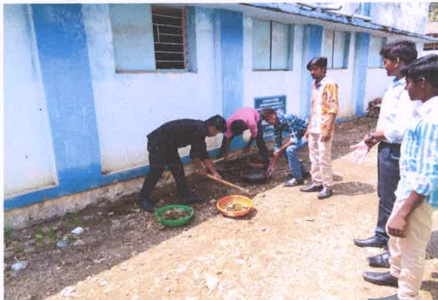
One Day Cleaning Program at Kallipatti school Area