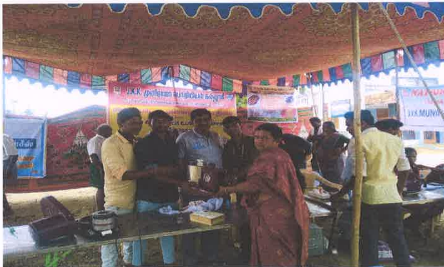
To collect Repaired Electrical things

PRINCIPAL JKK MUNIRAJAH COLLEGE OF TECHNOLOGY T.N. PALAYAM (Po)-638 506. GOBI (Tk), ERODE (Dt).