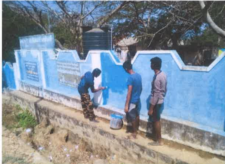
White Wash for School Front Wall