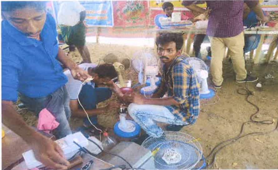
Electricals Repairing Work