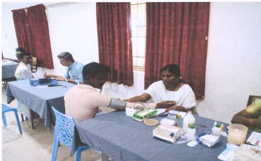
Photo of Free Medical Checkup for Our Students