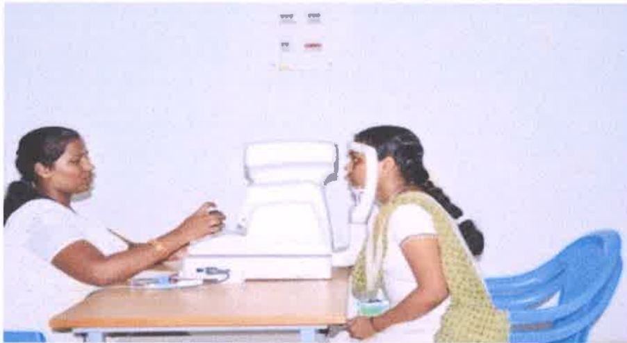
Photo of eye checkup