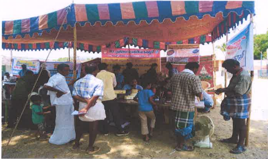
Free Electricals Repairing Camp (Kallipatti)