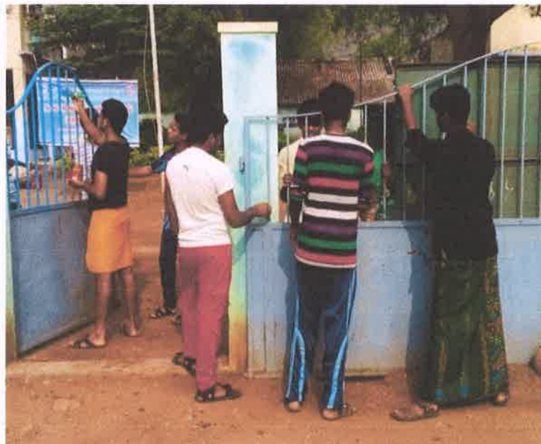
White Wash for School Gate